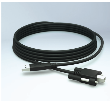
Secure USB Cable